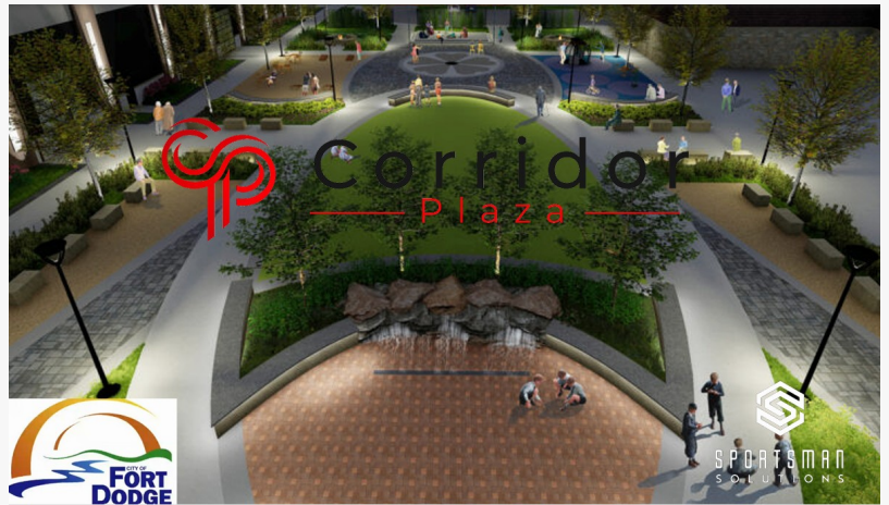
Fort Dodge Corridor Plaza & Pavilion Set to Open

FORT DODGE, IA, UNITED STATES, May 29, 2025 /EINPresswire.com/ -- City leaders in Fort Dodge have partnered with developer group M and M LLC to revitalize the former Crossroads Mall into the Corridor Plaza District. This development will be a dynamic, mixed-use destination designed to serve as a hub for commerce, community events, and regional tourism. The project features retail, dining, lodging, entertainment, convenience services, and a walkable plaza and pavilion that will support year-round events and recreation.