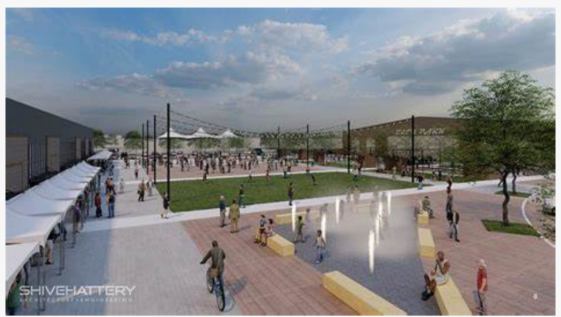
View of Outdoor Community Plaza