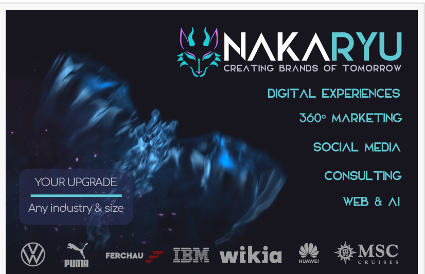
Nakaryu Web agency

Nakaryu is radically scalable. Companies choose what they need – and when. Whether you're a startup with a limited budget or a global brand launching campaigns across multiple channels, Nakaryu offers a flexible ecosystem where creative services function like