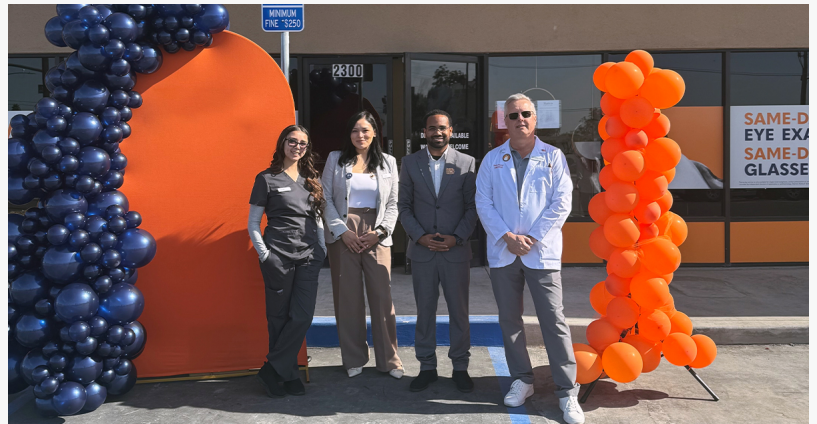
Stanton Optical Bakersfield (Columbus St) Staff Celebrating Grand Opening Ceremony

BAKERSFIELD, CA, UNITED STATES, May 30, 2025 /EINPresswire.com/ -- Stanton Optical, a pioneer in affordable and accessible eye care, announces the grand opening of its latest store in Bakersfield, CA, on May 26th. This new addition at 2300 Columbus St. Bakersfield, CA 93306 strengthens Stanton Optical's commitment to delivering on its mission of Making Eye Care Easy across 300+ locations nationwide.□□