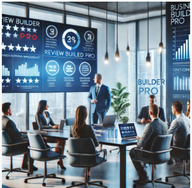
Review Builder Professional

"We believe that no business should be held hostage by unfair or fraudulent online content,"