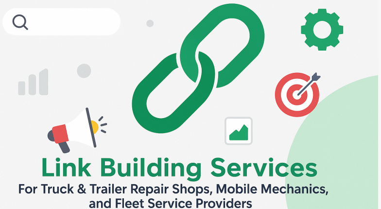
Illustration representing NTTRDirectory.com's link building services, featuring SEO and digital marketing elements designed for truck repair businesses.