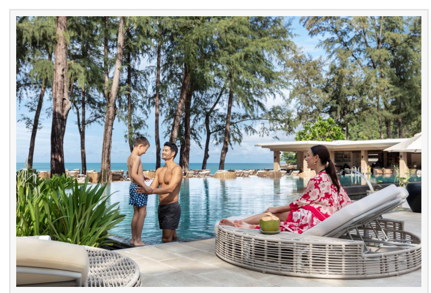
Family at Beach Pool

Kids can unleash their creativity at Planet Trekkers, the dedicated kids' club, packed with daily activities that educate and entertain. Young ecoheroes can join Planet Guardian sessions, learning how to protect our planet through fun, hands-on activities.