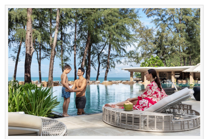
Family at Beach Pool

Kids can unleash their creativity at Planet Trekkers, the dedicated kids' club, packed with daily activities that educate and entertain. Young ecoheroes can join Planet Guardian sessions, learning how to protect our planet through fun, hands-on activities.