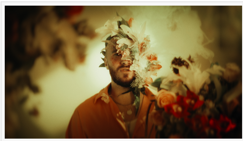
Still image from the "Speechless" music video — a visual statement on reclaiming voice, identity, and unapologetic self-expression.