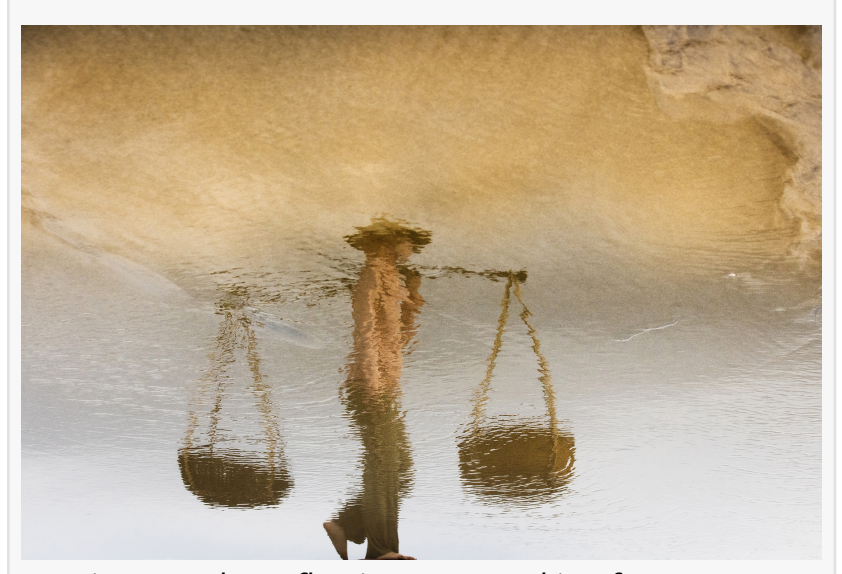
"Oasis" – A calm reflection captured in afternoon light, from Réhahn's Impressionist photography series

not to offer definitions, but to question, interpret, and transmit. Through a combination of research, personal perspective, and photographic experimentation, Réhahn explores whether the spirit of Impressionism can find new form through the camera lens.