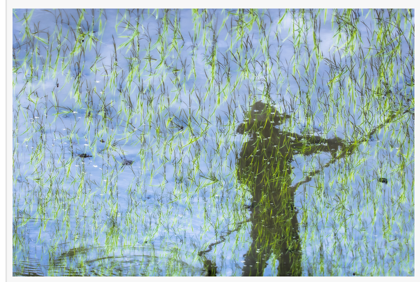
"Luminous" – A green rice field in early growth phase, blending motion and light