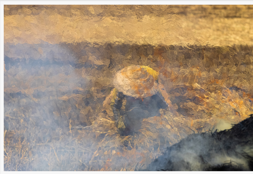
"Flame" – Heat distortion transforms a Vietnamese rural scene into a golden haze