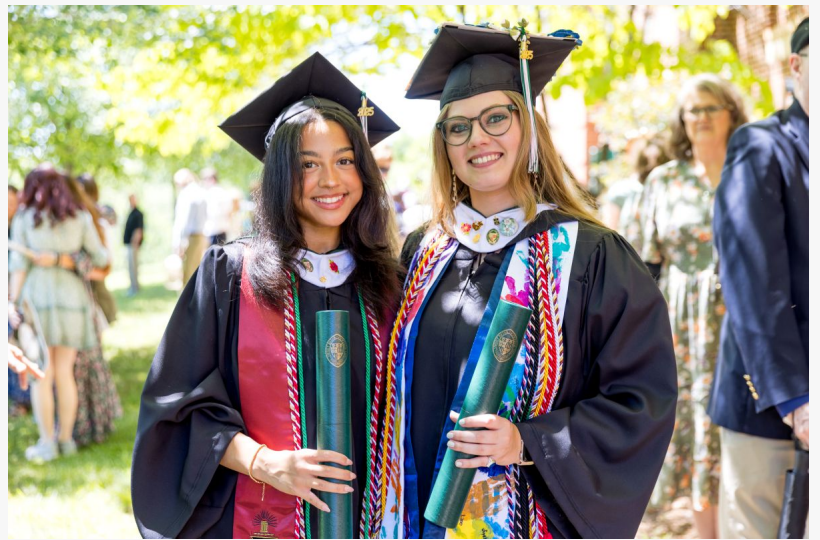
She Who Earns the Rose May Bear It