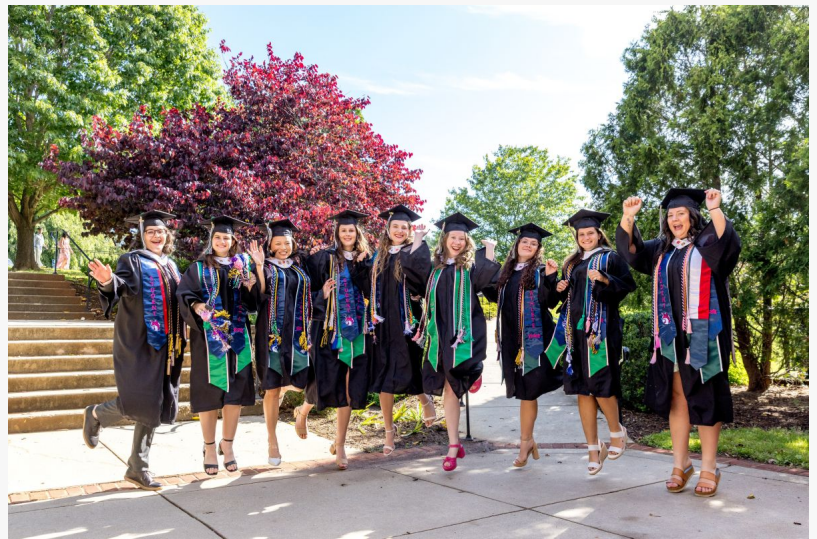
The College community gathered on May 17 to celebrate the Class of 2025's Commencement