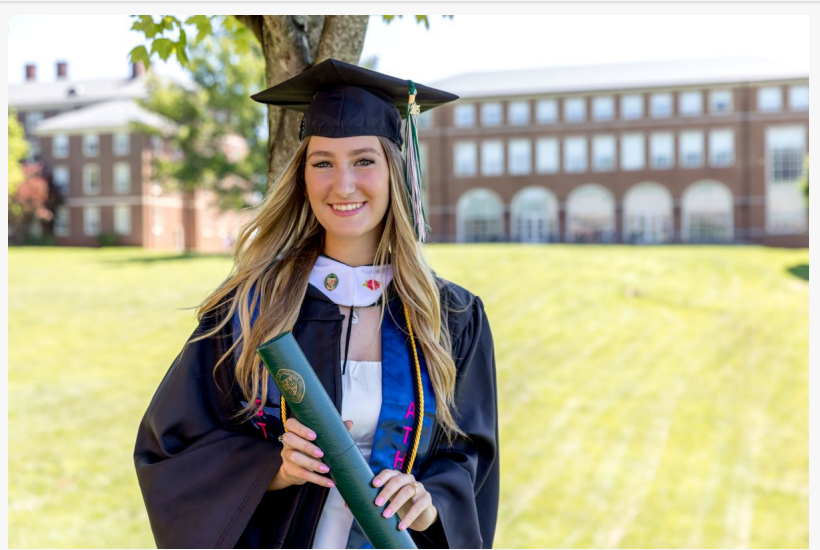
She Who Earns the Rose May Bear It