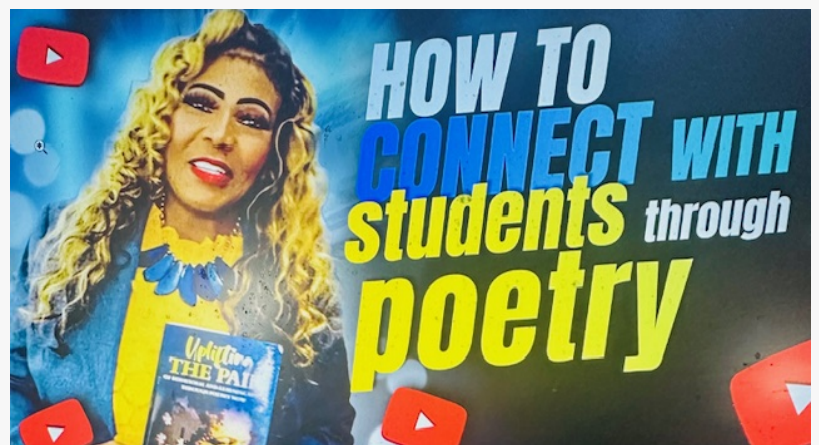
Student Connection Made Simple