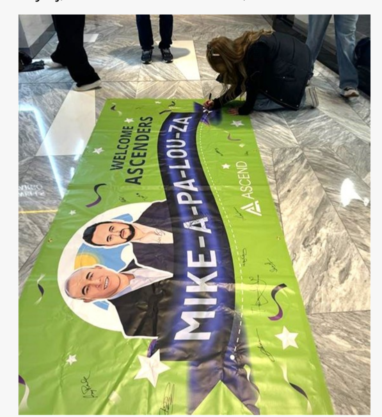
Mike-A-Pa-Lou-Za – Upper East Coast

relationships across departments and regions, and providing an informal platform for leadership to connect directly with team members, reinforcing Ascend's commitment to a highly collaborative culture.