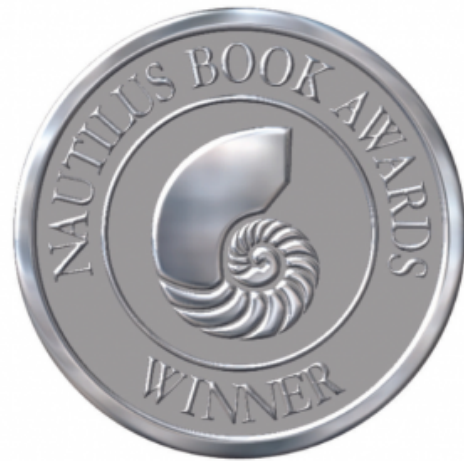
Nautilus Award Silver

Described by readers as both grounded and uplifting, factual yet inspiring, Living a Conscious Life offers profound, prescriptive guidance across a wide range of human experiences. With a clear and compassionate voice, Johnson delivers what many are calling