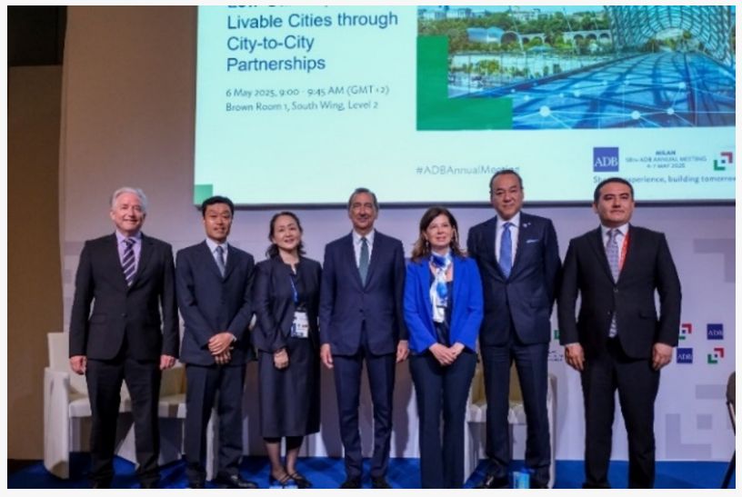
Distinguished presenters at the session in ADB Annual Meeting in Milano

Waterfront city center of Yokohama "Minato Mirai 21 district"