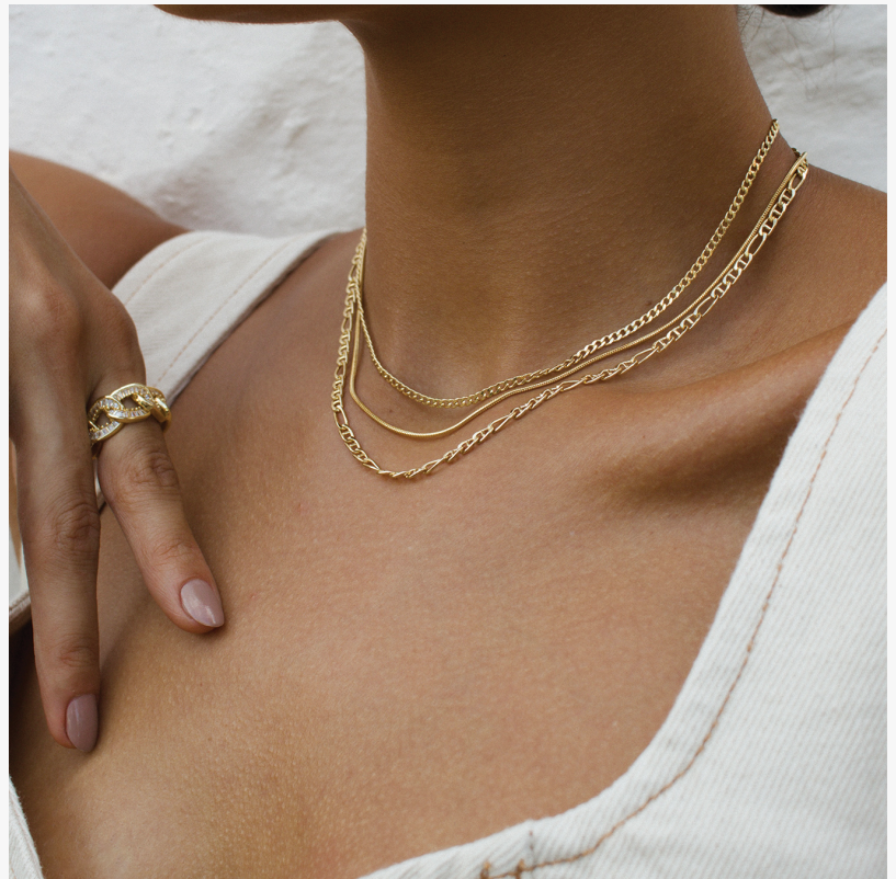
Layered 18K gold-filled waterproof necklaces by Velani Jewelry — hypoallergenic and made for sensitive skin, designed for Guam's tropical lifestyle.

Across regions like Guam, Hawaii, and other tropical zones, consumers frequently report that gold-plated jewelry fails to maintain its shine, color, or comfort. The high humidity, salt air, and constant exposure to sweat create an aggressive environment that traditional electroplated pieces struggle to withstand.