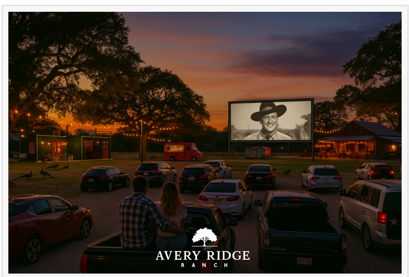
drive in movie theater in fredericksburg texas