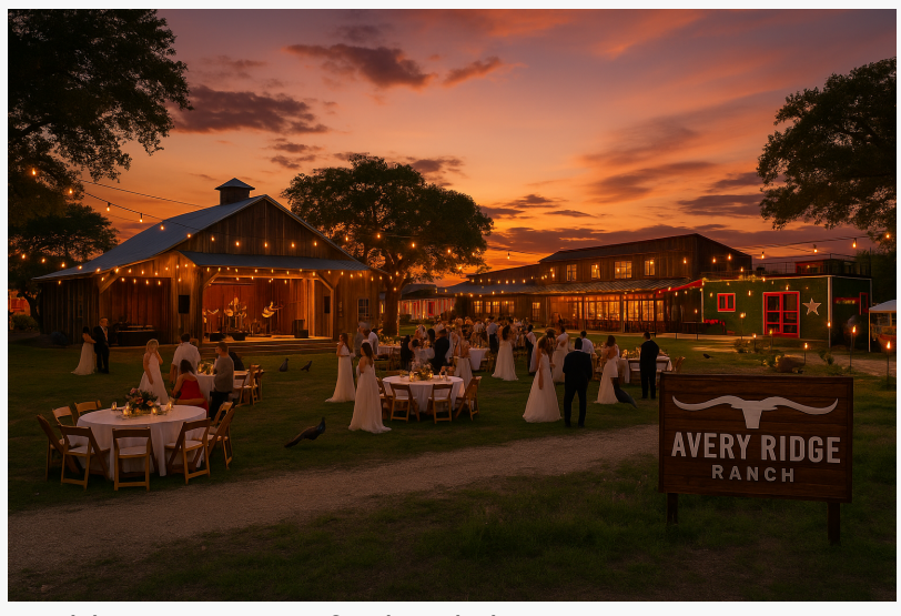
wedding venues in fredericksburg texas

accommodations in converted railroad container homes. These family- and pet-friendly lodgings provide an affordable base for exploring Fredericksburg's downtown shops, wineries, and attractions like Enchanted Rock.