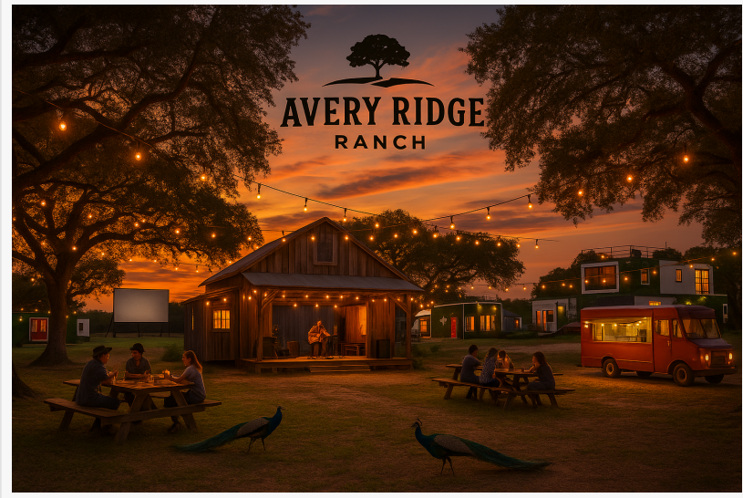
Best places to stay in fredericksburg texas for families

through Limohive.com will support these initiatives, ensuring accessibility for guests.