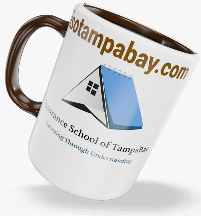
Coffee Break Mug