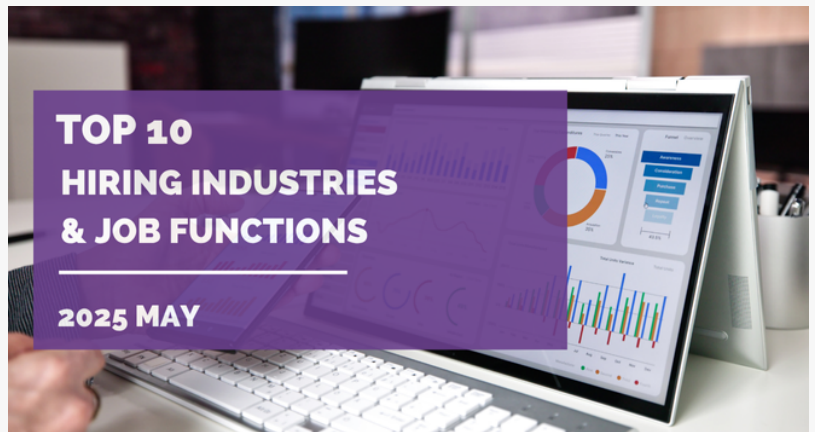
JobNet.com.mm May hiring insights -

The list below highlights the top 10 job functions with the most job postings on JobNet.com.mm for May 2025. Whether you're seeking to expand your team, streamline your workforce, or stay ahead in the talent acquisition