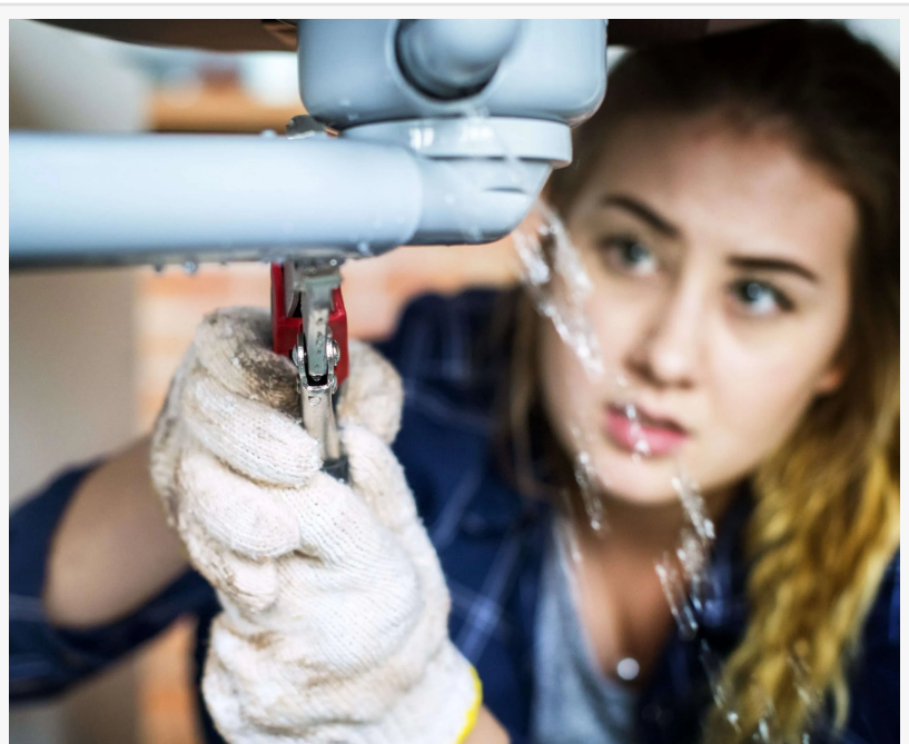
copper repipe San Jose

Failure to address copper pipe corrosion and pinhole leaks can lead to escalating damage, including water loss, structural deterioration, Mold growth, and compromised water quality. Timely identification and action are important to minimize such risks and maintain the safety