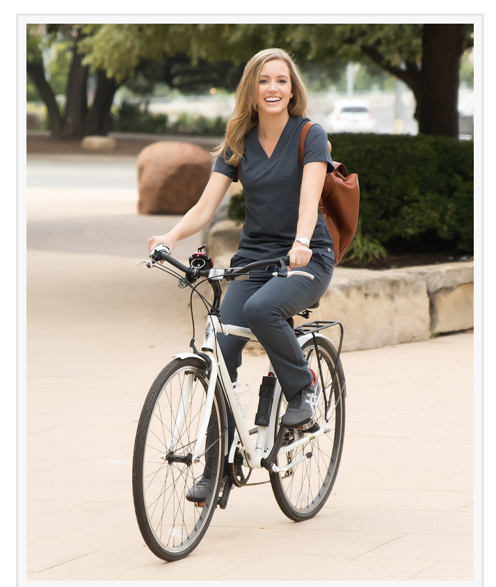
Blue Sky Scrubs

"The connection between environmental health and human health is undeniable," Beard says. "Every ride is a statement — that we care about future generations, cleaner skies, and healthier communities."