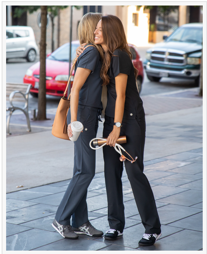
Blue Sky Scrubs

Declared by the United Nations in 2018, World Bicycle Day highlights the many benefits of cycling — a simple, affordable, reliable, and environmentally friendly means of transportation.