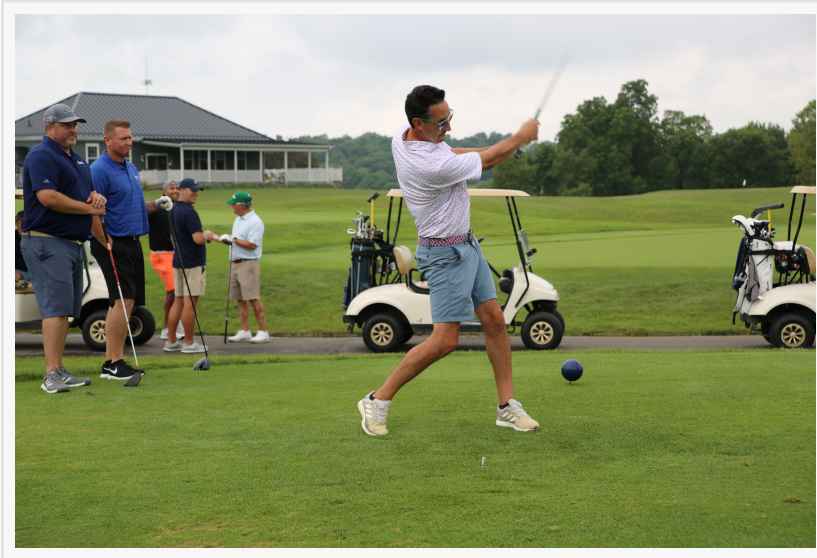
Golfer participating in Erney Tourney Charity Golf Outing for AngelWorks

COLUMBUS, OH, UNITED STATES, June 3, 2025 /EINPresswire.com/ -- The 14th Annual Erney Tourney Charity Golf Outing returns to the Links at Echo Springs on Friday, August 8, 2025, at 9 a.m. The event raises funds for the AngelWorks Foundation and its mission to assist children battling cancer.