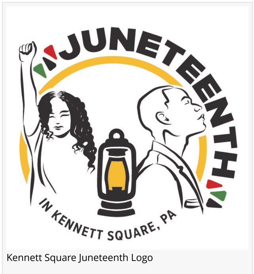
Kennett Square Juneteenth Logo

The community organization are: Kennett Collaborative, Kennett Heritage Center, Kennett Underground Railroad Center, Kennett Flash, Kennett Area Community Services, Kennett Library, New Garden UAME Church, Martin Luther King CommUNITY of Greater Kennett Area, and Kennett Area Park Authority.