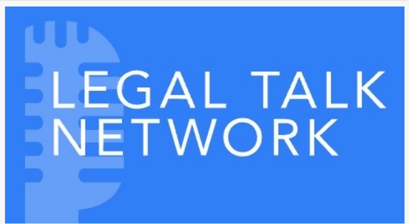
Legal Talk Network