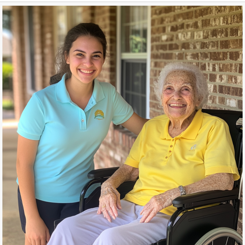
Home Care in Mesa Made Easy

Beyond service descriptions, MesaHomeCare.net addresses common concerns and questions families may have, such as: