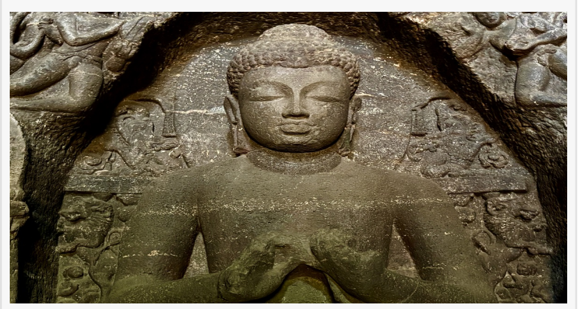
Buddha - Meditative Posture