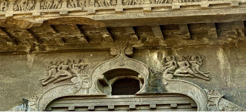
Buddhist Prayer Hall