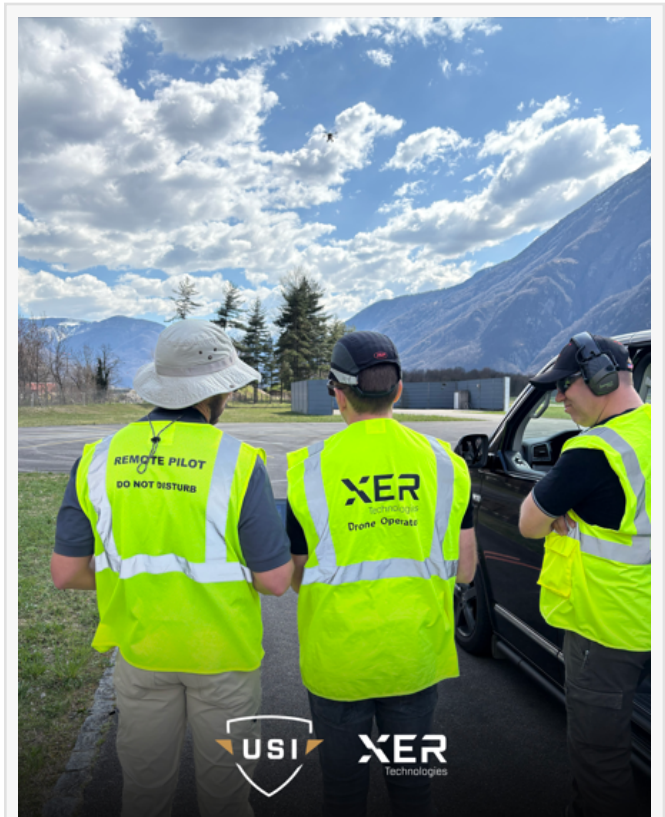
Team USI in Switzerland Training on the Xer Tech X8