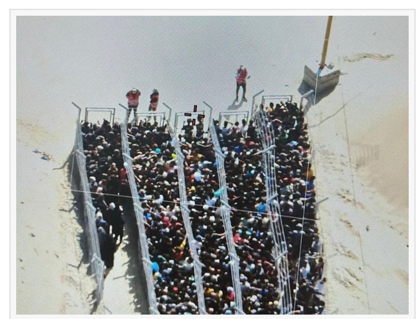
Starving Palestinians walking over 15km in danger zones to receive the so called aid

With Over 600 Days of Genocide and Forced Starvation Devastating Gaza Under Israel's Ongoing Blockade and Former Biden State Dept. Spokes Admitting that Israel "Without Doubt" Committed War Crimes, US Doctors to