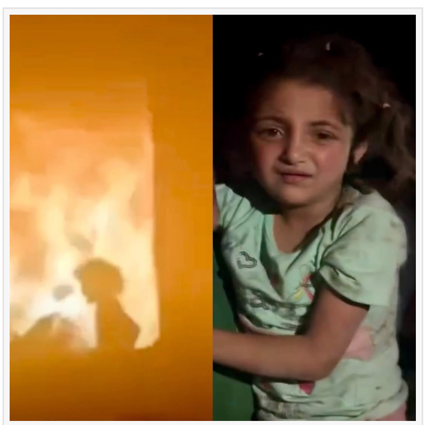
A Palestinian girl tries to escape the fire after a school was bombed while they were sleeping.

This action, led by Doctors Against Genocide, unites medical professionals from diverse backgrounds in a single call, compelled by their oath to save lives: Congress must end the role that