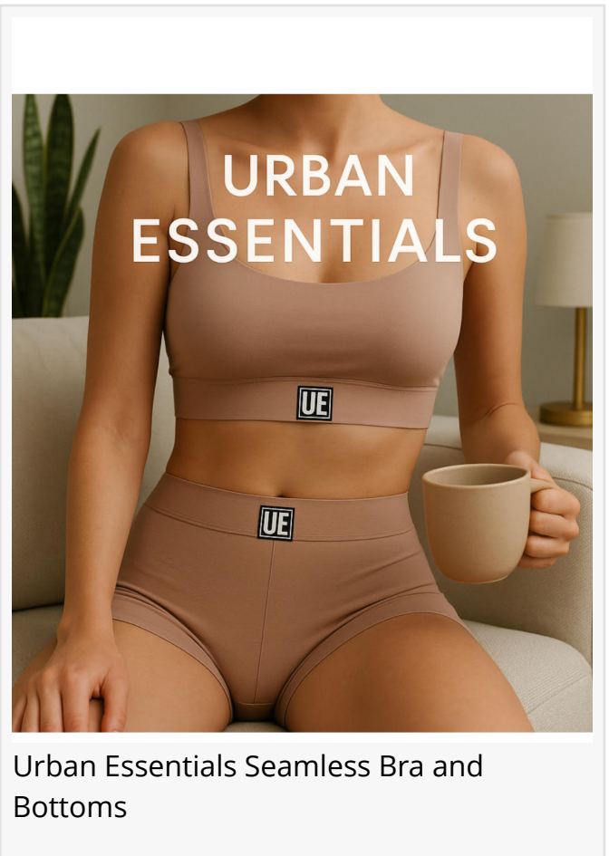
Urban Essentials Seamless Bra and Bottoms

This press release can be viewed online at: https://www.einpresswire.com/article/818650879