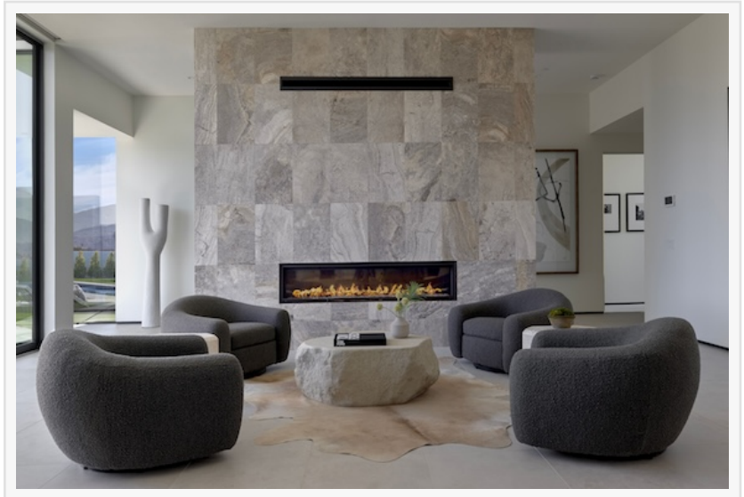
LINEA monolithic floor-to-ceiling lineal fireplaces