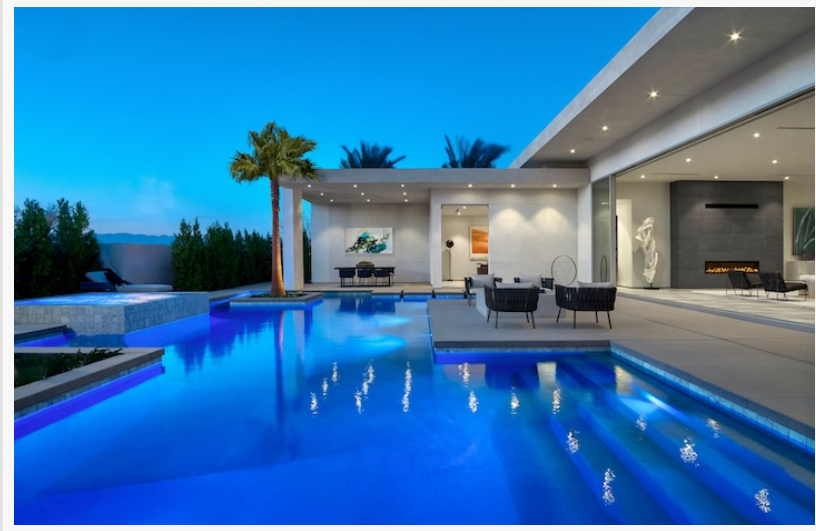
Sleek, striking, and sculptural