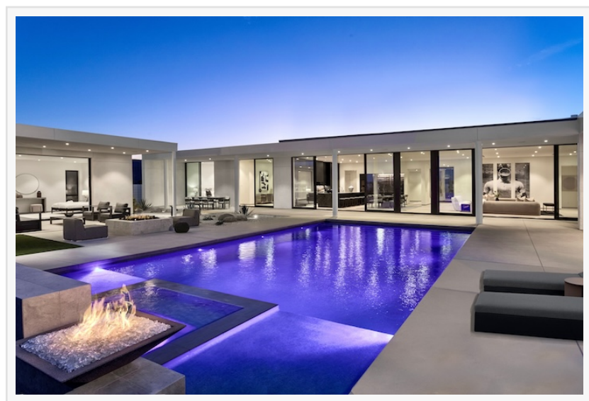
Fire, water, and glass converge in perfect modern harmony

This press release can be viewed online at: https://www.einpresswire.com/article/818676567