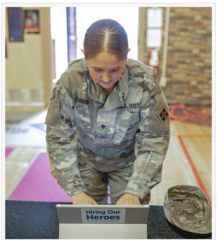
A transitioning service member prepares for the next chapter through the Hiring Our Heroes Fellowship Program. At SmartLab, veterans bring their skills, leadership, and perspective into a workplace where purpose-driven learning continues beyond the classroom.

These workplace "ah-HA! moments"—sudden realizations that spark when learners connect ideas in meaningful ways—are as valuable in the office as they are in the lab. Through the HOH program, SmartLab is extending its ecosystem of active learning and experiential growth into new territory, empowering veterans to transition with clarity and confidence.