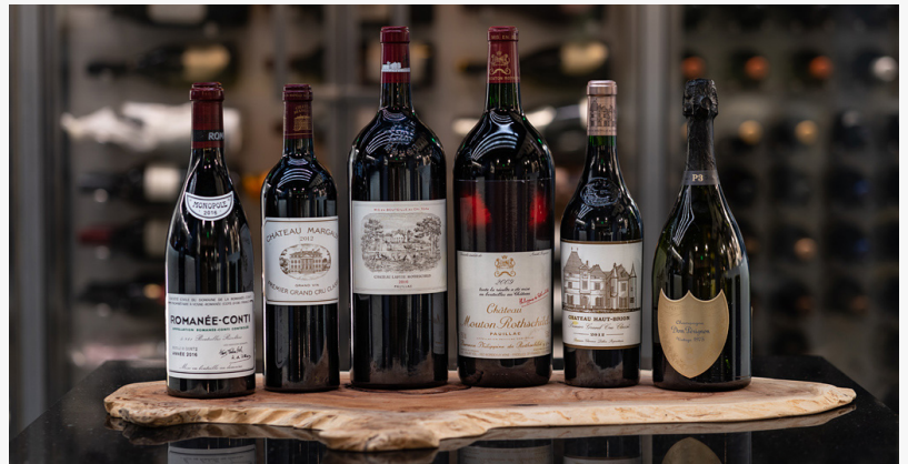
Wine Gallery at Mugen Waikiki

SAN FRANCISCO, CA, UNITED STATES, June 4, 2025 /EINPresswire.com/ -- Wine Spectator's announcement of the 2025 Restaurant Awards celebrates a diverse group of restaurants that have achieved excellence in wine curation, service, and presentation. This year's list includes multiple award-winning restaurants using My Wine Guide's SommOne® platform to power their wine programs.