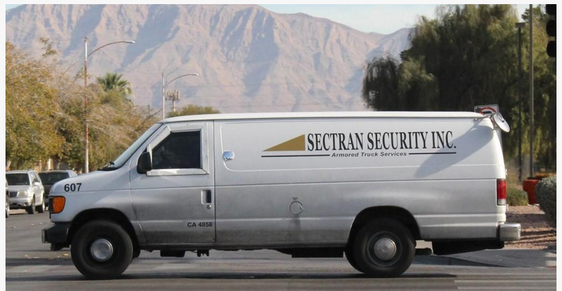
cost of armored transport in Arizona -