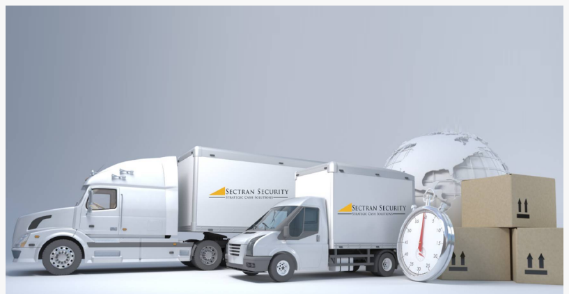
Hire an Armored Car