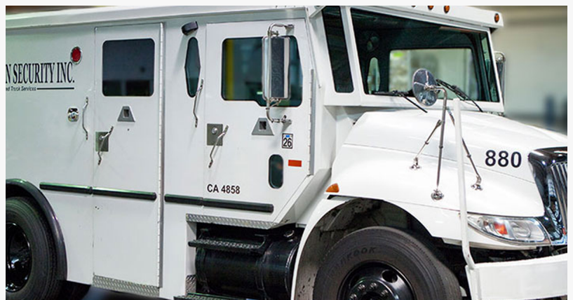
Armored car cost in Arizona

In Arizona, armored car cost is usually tied to a few key factors. First is the size of the job. More pickups or longer routes will cost more. Second is location. Cities may have different pricing than rural areas. Lastly, the type