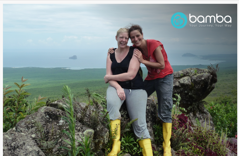
Happy travelers in Galapagos.