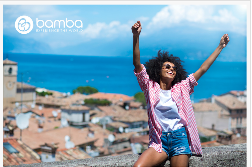
Dancing influencer on vacation - Bamba Travel

Whether it's a Patagonia road trip , a cultural loop through Central America, or a family vacation in Japan , Bamba's technology ensures faster quotes, real-time booking, and improved conversion rates.