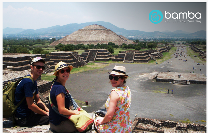
Three happy tourists in Teotihuacan