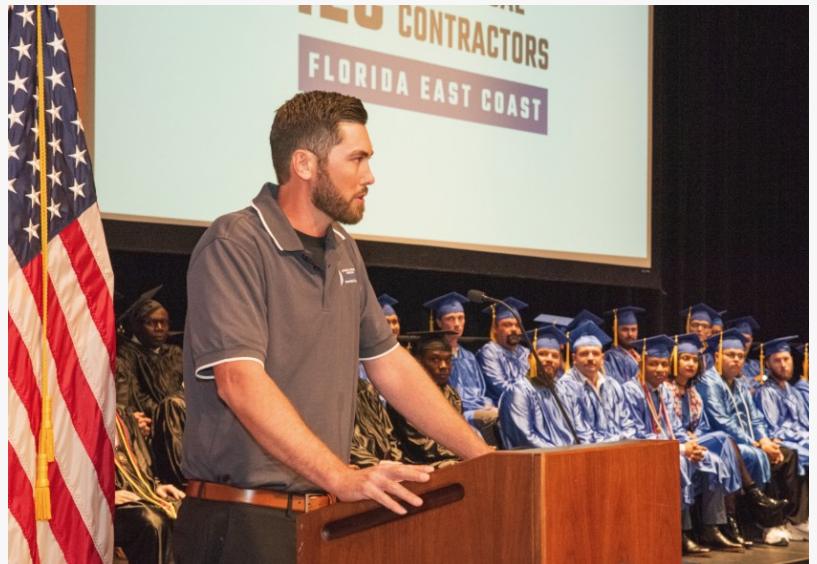
Former IEC graduate and an IEC-FECC instructor