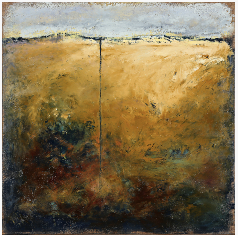
Catherine Eaton Skinner, Albedo II, Encaustic, oil stick, linen on panel, 36"x36"x2"