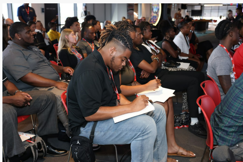
Participants take notes during an Athletes Abroad Summit session, focused on business, branding, and building life beyond the game.