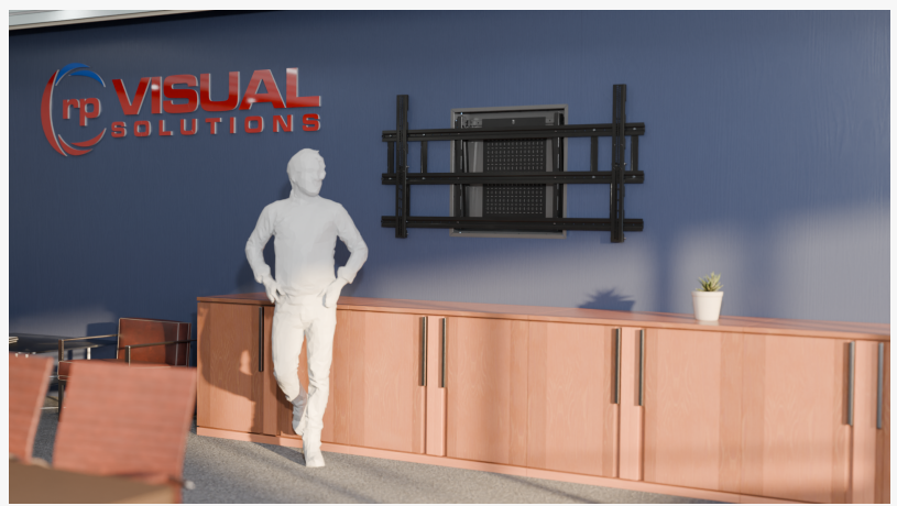
Universal 158 flat panel display mounting system shown for scale