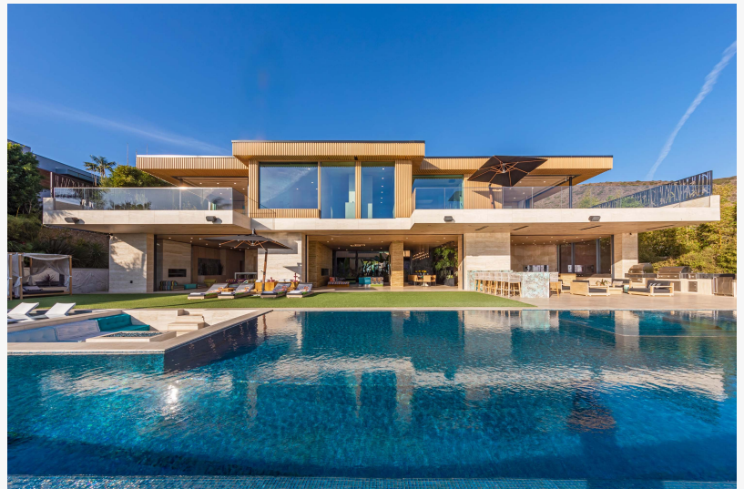
20,000sf Contemporary Estate with 95-Foot Infinity Pool & Ocean Views