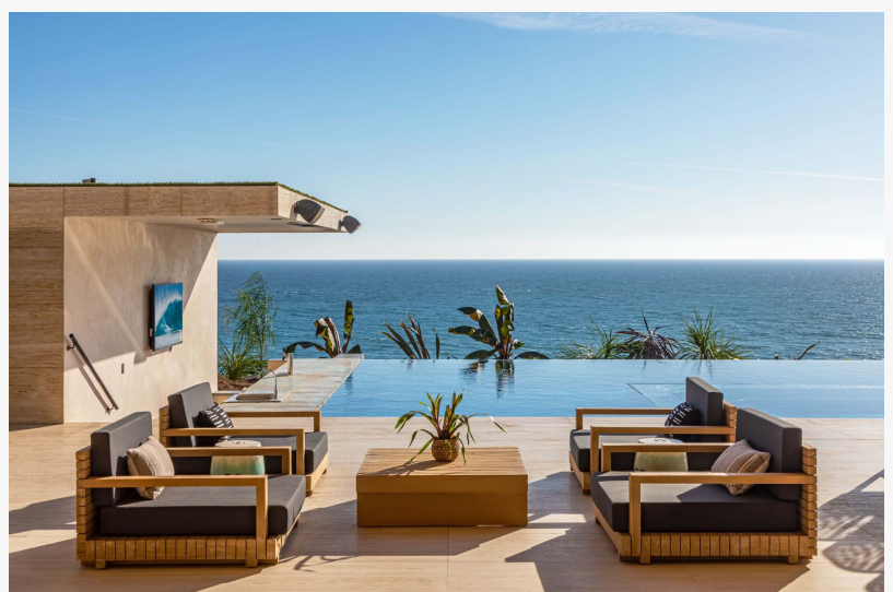
Resort Amenities: Dolby Atmos Theater, Swim-Up Bar & Entertainment

Two spacious four-car garages are equipped with electric vehicle charging stations, with additional guest parking available throughout the grounds. Located within Malibu's exclusive Marisol development, the property also benefits from advanced fire prevention systems, ensuring peace of mind in a secure, prestigious setting.