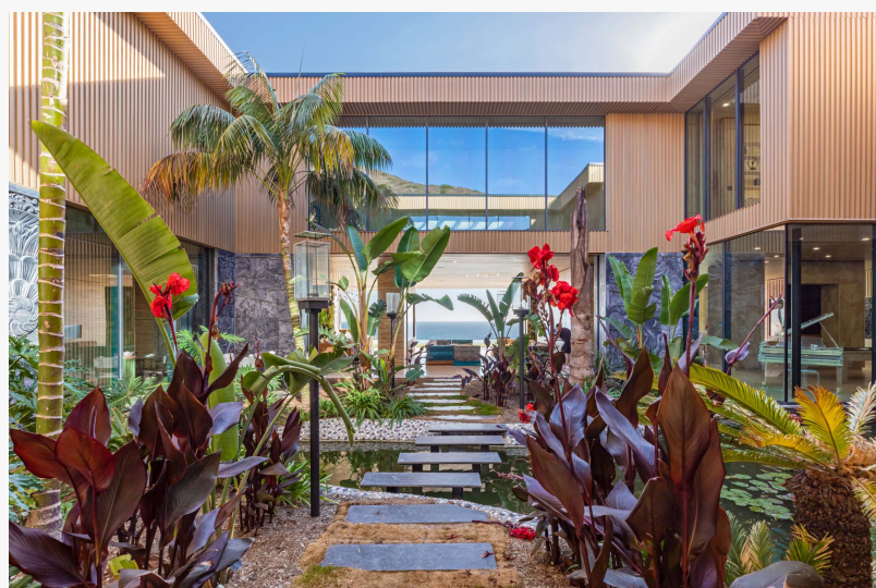
Six Private Bedroom Suites, Each with Dedicated Outdoor Terraces

Concierge Auctions is the world's largest luxury real estate auction marketplace, with a state-of-the-art digital marketing, property preview, and bidding platform. The firm matches sellers of one-of-a-kind homes with some of the most capable property connoisseurs on the planet. Sellers gain unmatched reach, speed, and certainty. Buyers receive curated opportunities. Agents earn their commission in 30 days. Acquired by Sotheby's, the world's premier destination for fine art and luxury goods, and Anywhere Real Estate, Inc (NYSE: HOUS), the largest full-service residential real estate services company in the United States, Concierge Auctions continues to operate independently, partnering with real estate agents affiliated with many of the industry's leading brokerages to host luxury auctions for clients. For Sotheby's International Realty listings