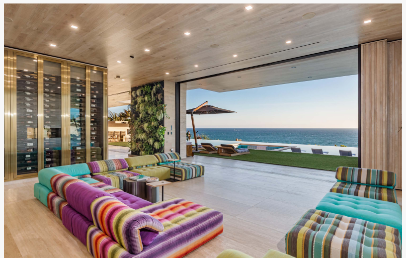
Super-Engineered Concrete Construction Built to Last Centuries