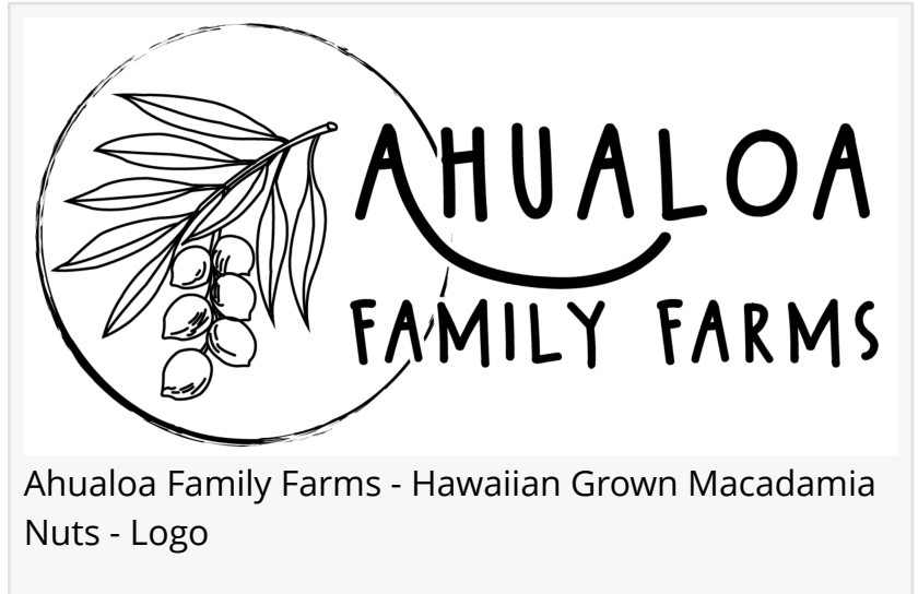
Ahualoa Family Farms - Hawaiian Grown Macadamia Nuts - Logo

www.AhualoaFamilyFarms.com . It's all macadamia nut recipes !