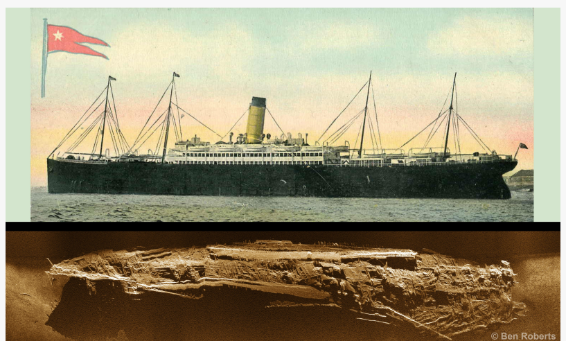
RMS Republic - Then and Now - Port

MIAMI BEACH, FL, UNITED STATES, June 5, 2025 /EINPresswire.com/ -- In the fog-bound waters off Nantucket on January 23, 1909, two ships collided in what would become one of history's most consequential maritime disasters—and its greatest treasure mystery, now on the verge of being solved and promising the largest single gold recovery in history.