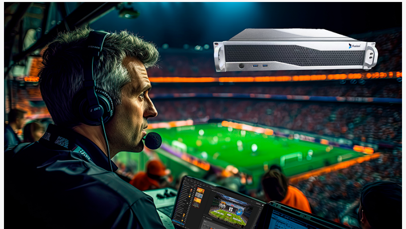
Command the Arena: Fusion NDI, SDI, and EXTREME Drive Next-Level Live Graphics