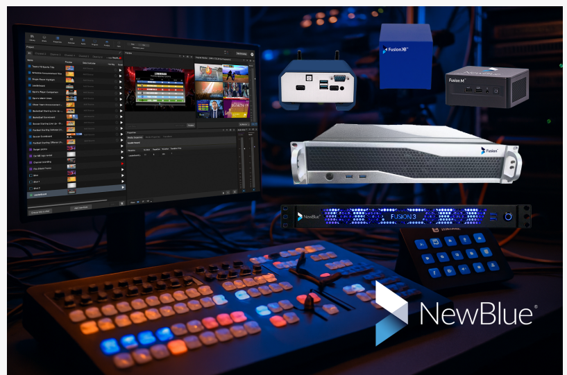
Complete EMEA Fusion Hardware Lineup

SAN DIEGO, CA, UNITED STATES, June 5, 2025 /EINPresswire.com/ -- NewBlue , a global leader in live video graphics innovation, is proud to unveil the EMEA Fusion line—a new collection of powerful, region-optimized live graphics appliances built for today's fast-moving productions across Europe, the Middle East, and Africa (EMEA).