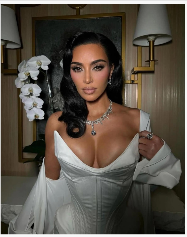
He works with iconic celebrities such as The Kardashians and Jenner family as long standing loyal clients.