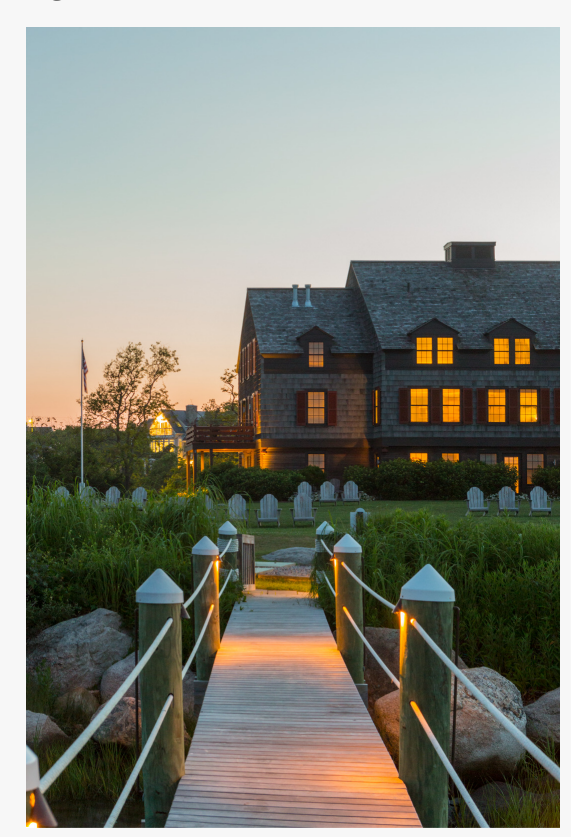
Evening at Weekapaug Inn

This press release can be viewed online at: https://www.einpresswire.com/article/819326717 EIN Presswire's priority is source transparency. We do not allow opaque clients, and our editors