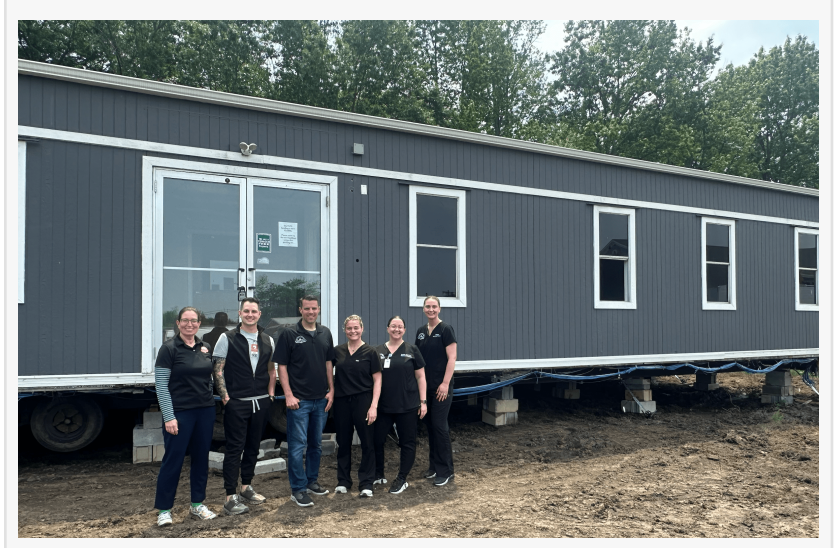
Primary Care Temporarily Relocated As Mount Laurel Animal Hospital Constructs Standalone Wellness Center

Other areas of the hospital are also seeing significant upgrades, including a doubling of both the ICU and isolation wards. The project will also bring three additional state-of-the-art surgery