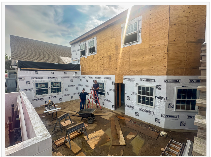
Ongoing construction brings new facilities, expanded services, and a brand-new wellness center to meet the community's growing needs.

As part of this initiative, two new large parking lots are also in the works—a much-anticipated improvement aimed