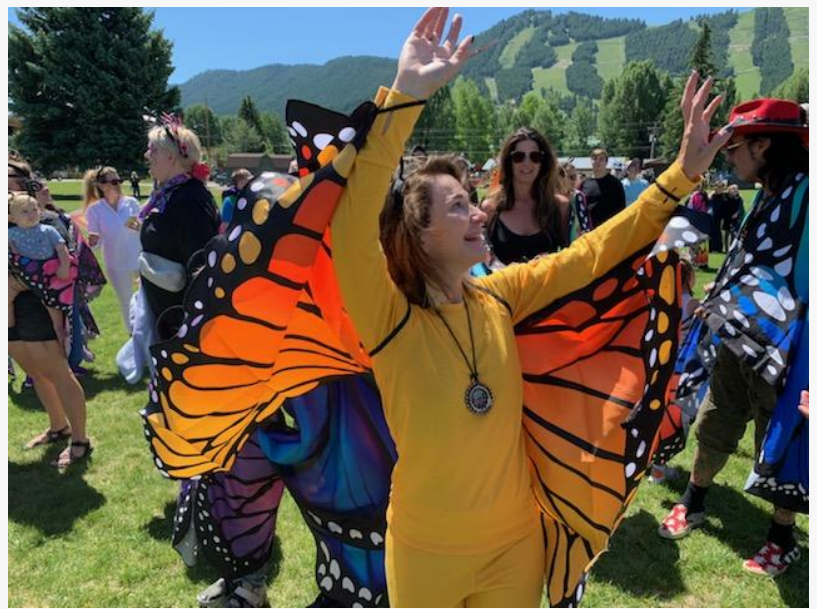
A section of joyful participants during the in-person gathering in Davey Jackson Field, Jackson, WY, last June. This year's event is on June 28, same venue.