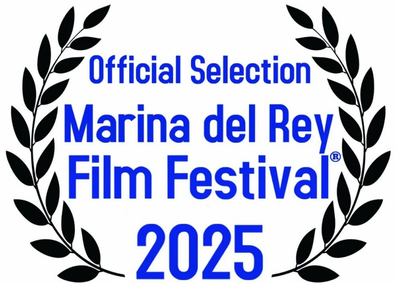
Marina del Rey Film Festival official selection logo. Logo: Courtesy.

Viewers will see what transpired during last year's Grand Butterfly Gathering, the official attempt