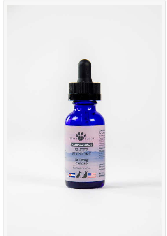
The Sleep Support Hemp Extract from Earth Buddy is included in the giveaway and contains a 4:1 ratio of CBN to CBD.

In conjunction with the campaign, Earth Buddy will highlight the results from its 2022 Pet