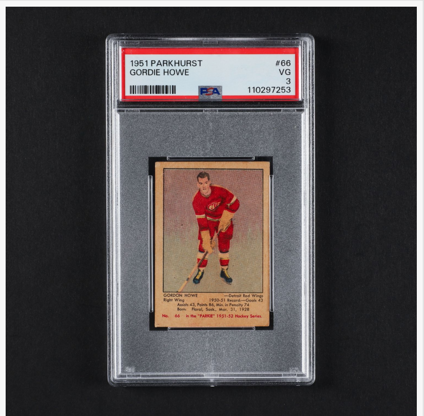
1951 Parkhurst #66 Gordie Howe hockey rookie card, graded 3 Very Good PSA. It has strong eye appeal and is the centerpiece of the '51-'52 Parkhurst set. Estimate: CA$8,000-$10,000.

To consign a single piece, an estate or a collection, you may call them at (519) 573-3710; or, you can e-mail them at info@millerauctions.com . To learn more about Miller & Miller Auctions, Ltd. and the Pre-1980 Sports Cards & Memorabilia auction scheduled for Sunday, June 22nd, please visit www.MillerandMillerAuctions.com . Updates are posted frequently.