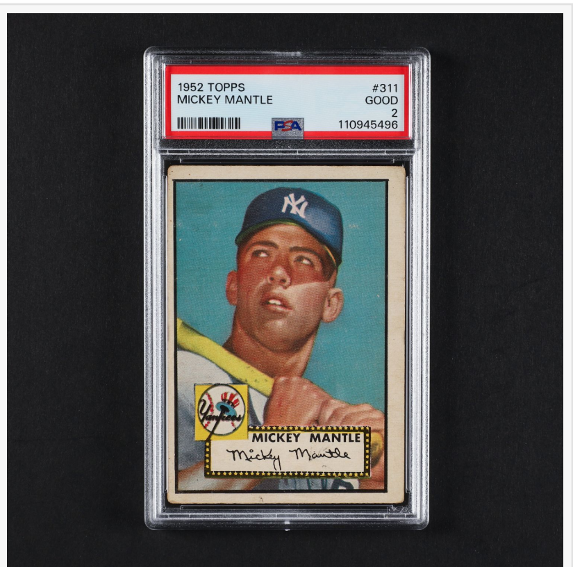
1952 Topps #311 Mickey Mantle “holy grail” baseball card, graded 2 Good from PSA for its excellent surface and strong edges, a must-have for collectors. Estimate: CA$40,000-$50,000.