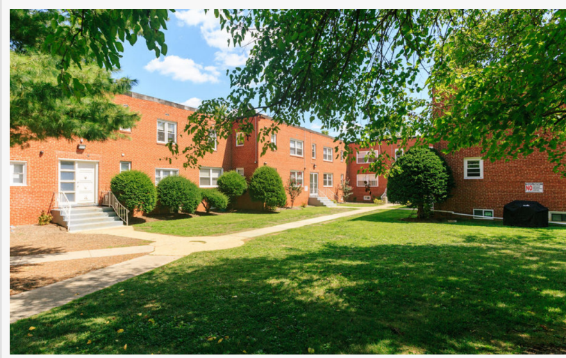
Maryland Addiction Recovery Center Building