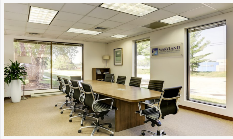
Maryland Addiction Recovery Meeting Room