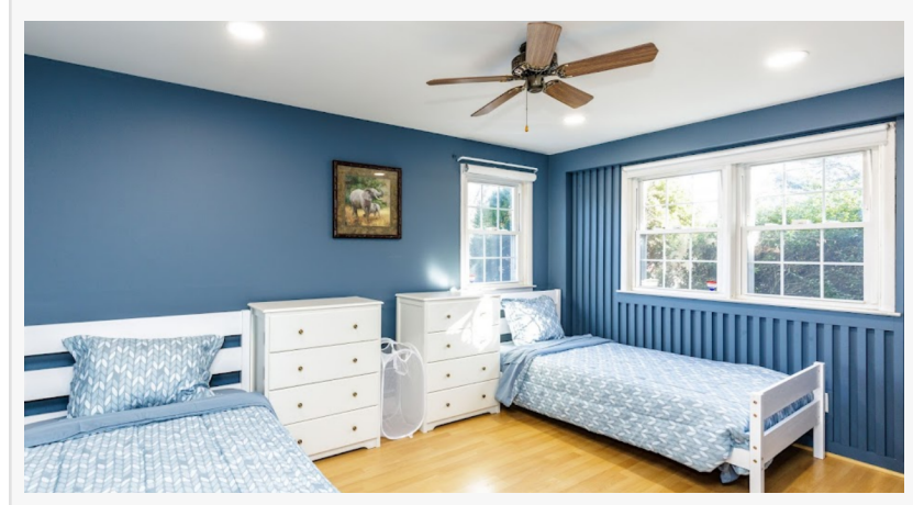
Maryland Addiction Recovery Center Bedroom

and substance use is vital. Overlooking one condition often results in inadequate care, missed diagnoses, and a greater likelihood of relapse.