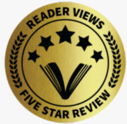
Five Star Accolades