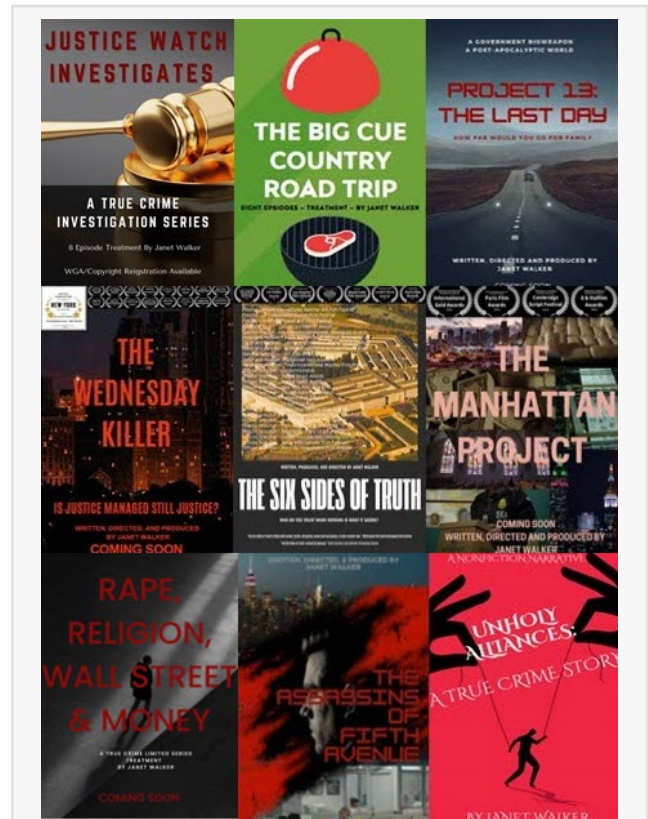
Slate of Projects Unveiled at the European Film Market.

“The Assassins of Fifth Avenue,” an edgy crime thriller, tells the story of a wealthy criminal mastermind, a serial killer, and a reporter determined to uncover the truth and the exiled detective she enlists to help her find the killer